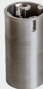
Over-run brake (optional)