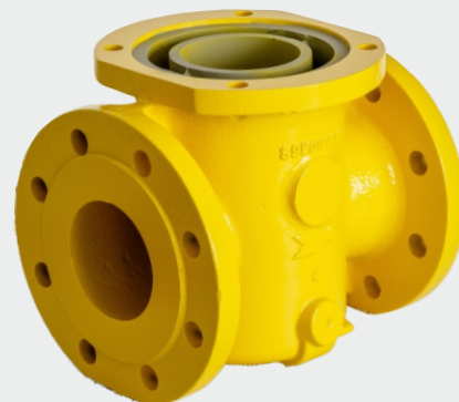
Monopipe adaptor EAS

light weight, in any installation arrangement and low cost. However gas meters with the velocity measuring principle are not ideal for intermittent operation. When an energy consuming installation is suddenly switched off, the meter does not react immediately. The freely moving turbine wheel continues to rotate at a slowly decreasing speed and will produce an error. In such case this error can be eliminated by installation of over-run brake.