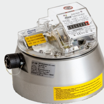
Radial-blade turbine gas meter head

Axial-blade turbine or radial-blade turbine gas meters are most often used for measuring consumption of heating gas supply systems. All turbine meters of this construction are based on the principle of velocity measurement. The advantages of the radial blade turbine gas meter are mainly to be found in its simple installation, small size,